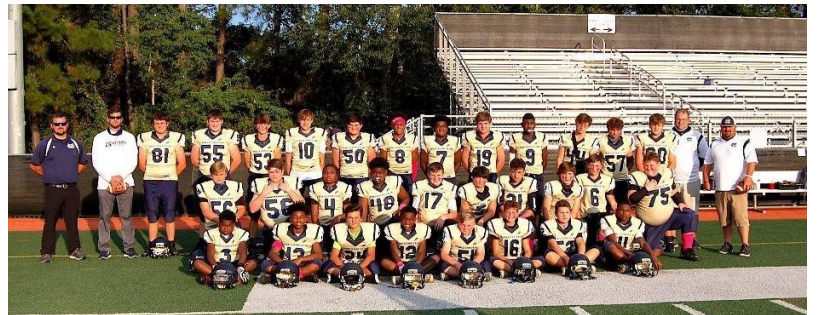
Middle School Football Division Champions