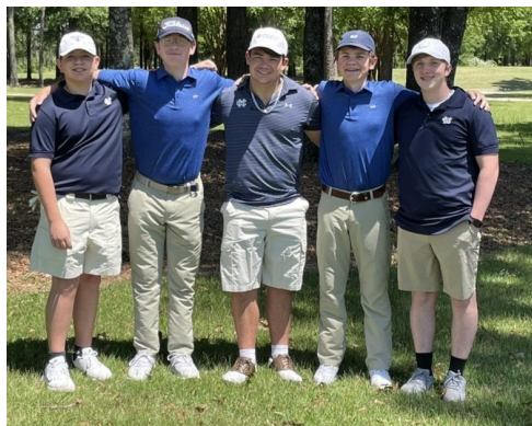
Boys Golf Team

*Photos were not available for JV Baseball or Middle School Baseball