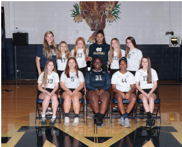
Junior Varsity Volleyball