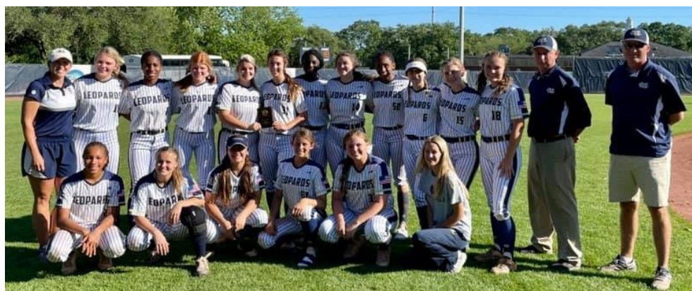
Varsity & JV Softball Team