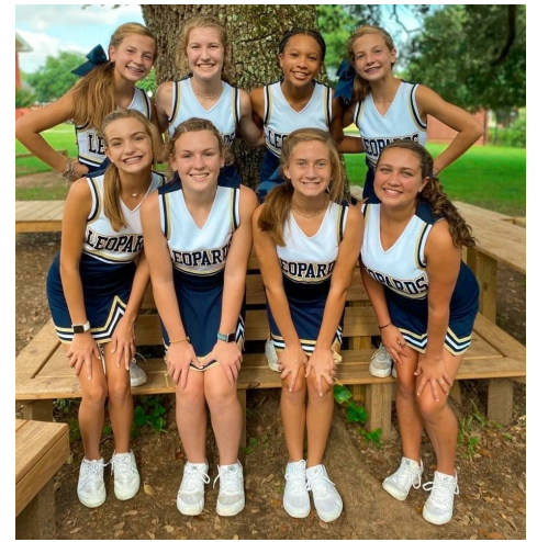
Middle School Cheerleaders