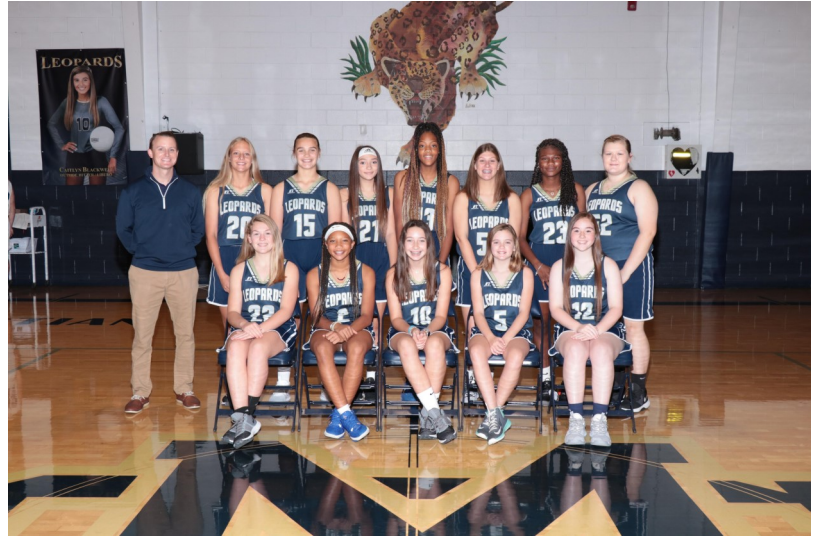
Middle School Girls Basketball Small School Tournament Champions