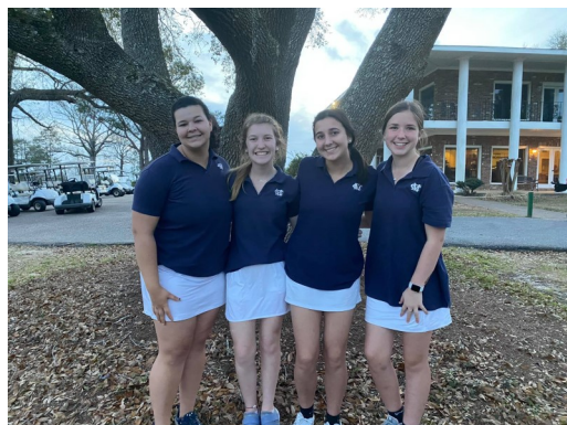
Girls Golf Team 3A Sub State Champions