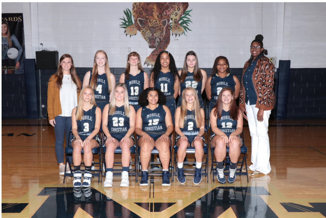
Varsity Girls Basketball Team