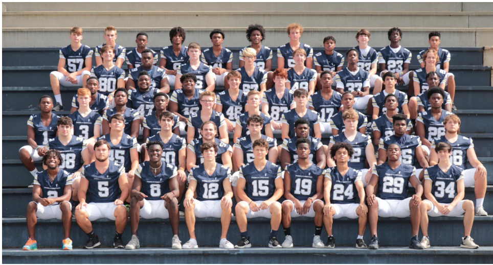
2020 Varsity and JV 4A Football Advanced to 2nd Round Playoffs