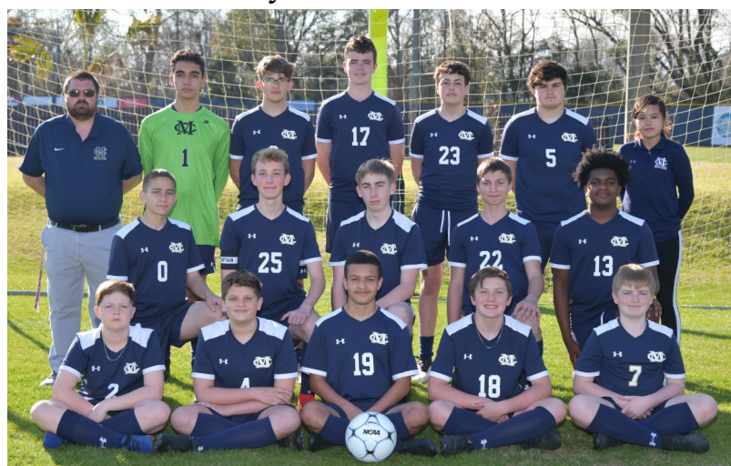
Varsity Soccer Team