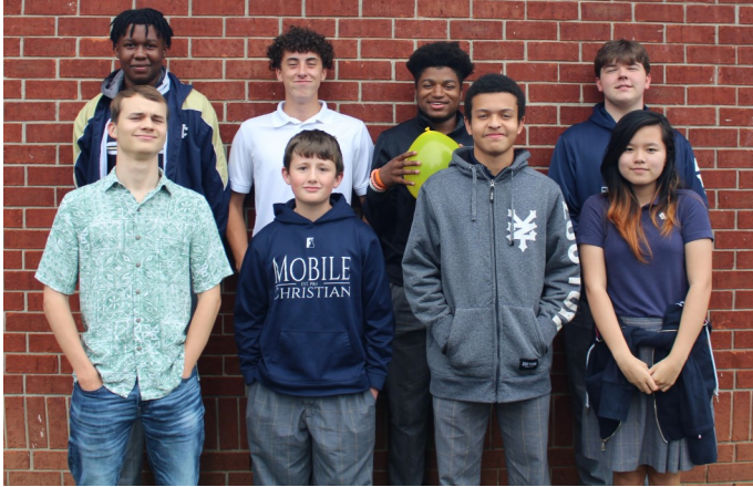
E Sports Team