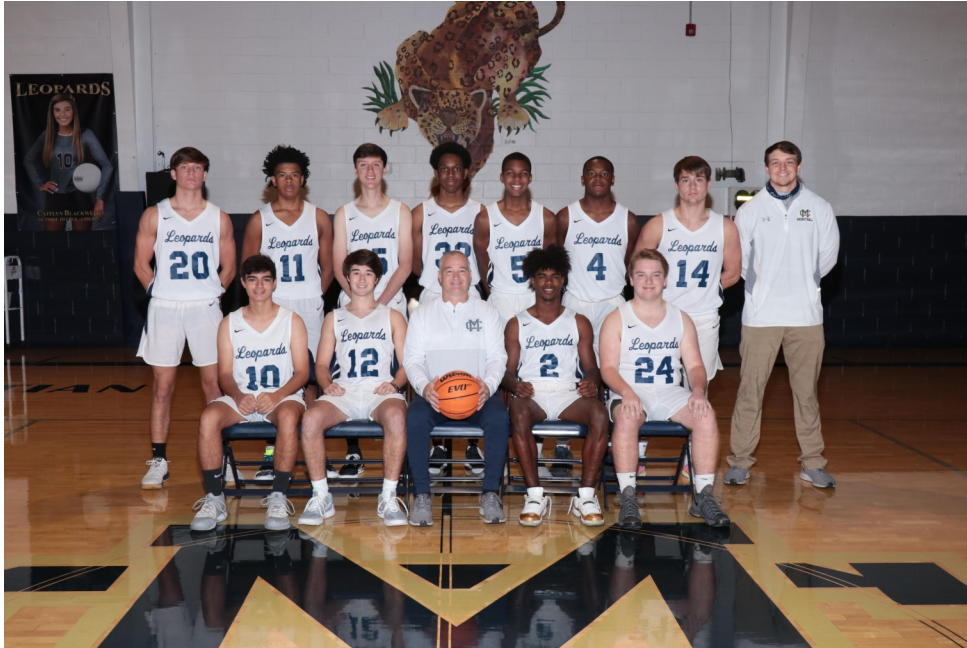
Varsity Boys Basketball Team Ranked #5 in the State in 3A