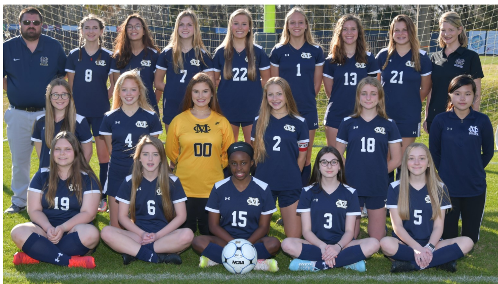
Varsity and JV Girls Soccer