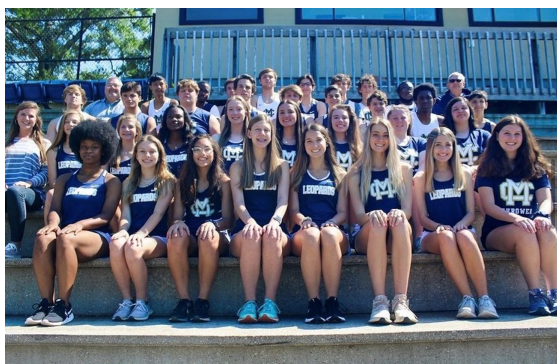
3A State Runner Up-Track Team