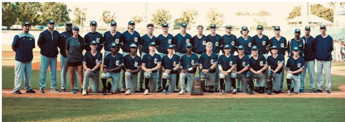
4A 2021 State Champions Varsity Baseball Team