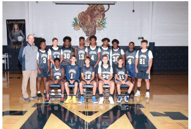
Middle School Boys Basketball