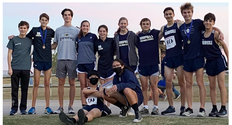
Varsity Cross Country