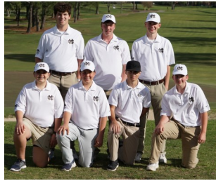
Boys Golf Team