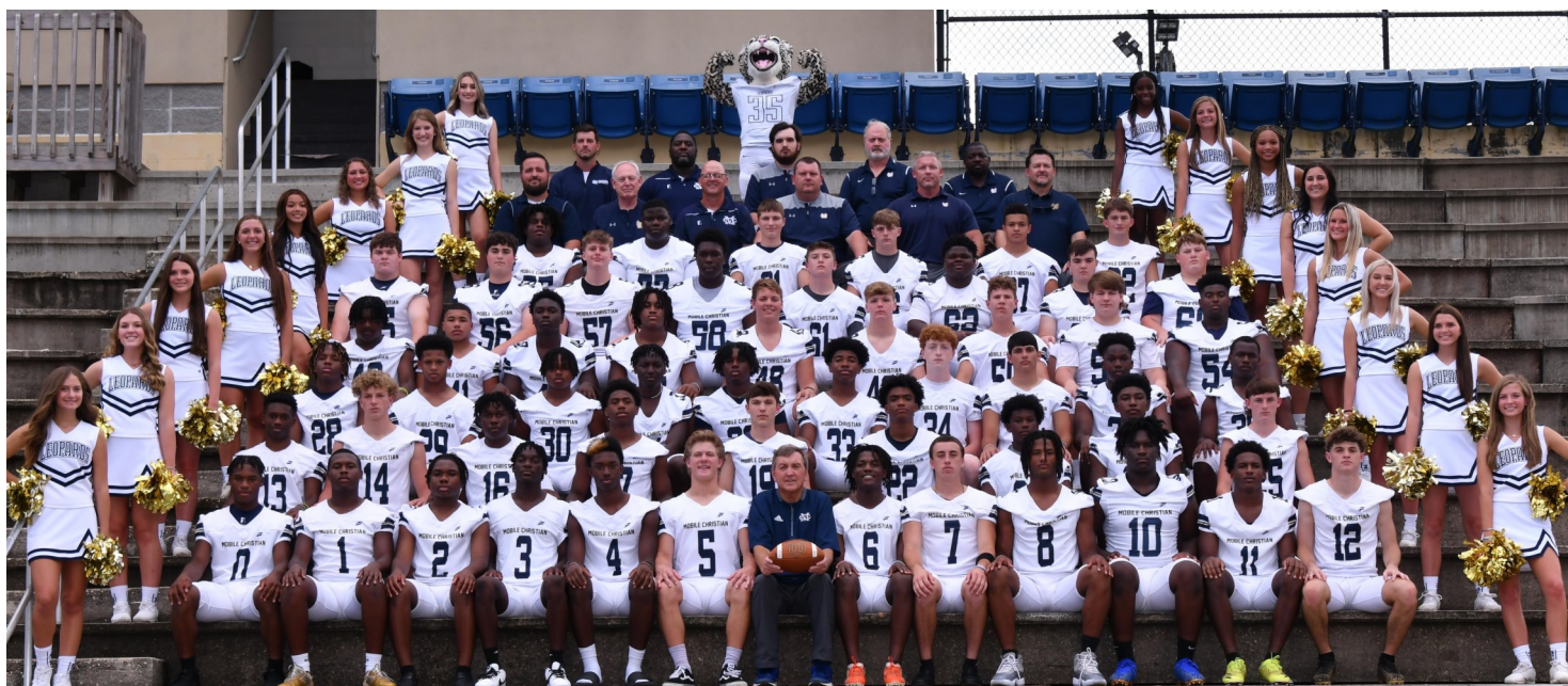
2022 Varsity and JV Football & Varsity Cheerleaders