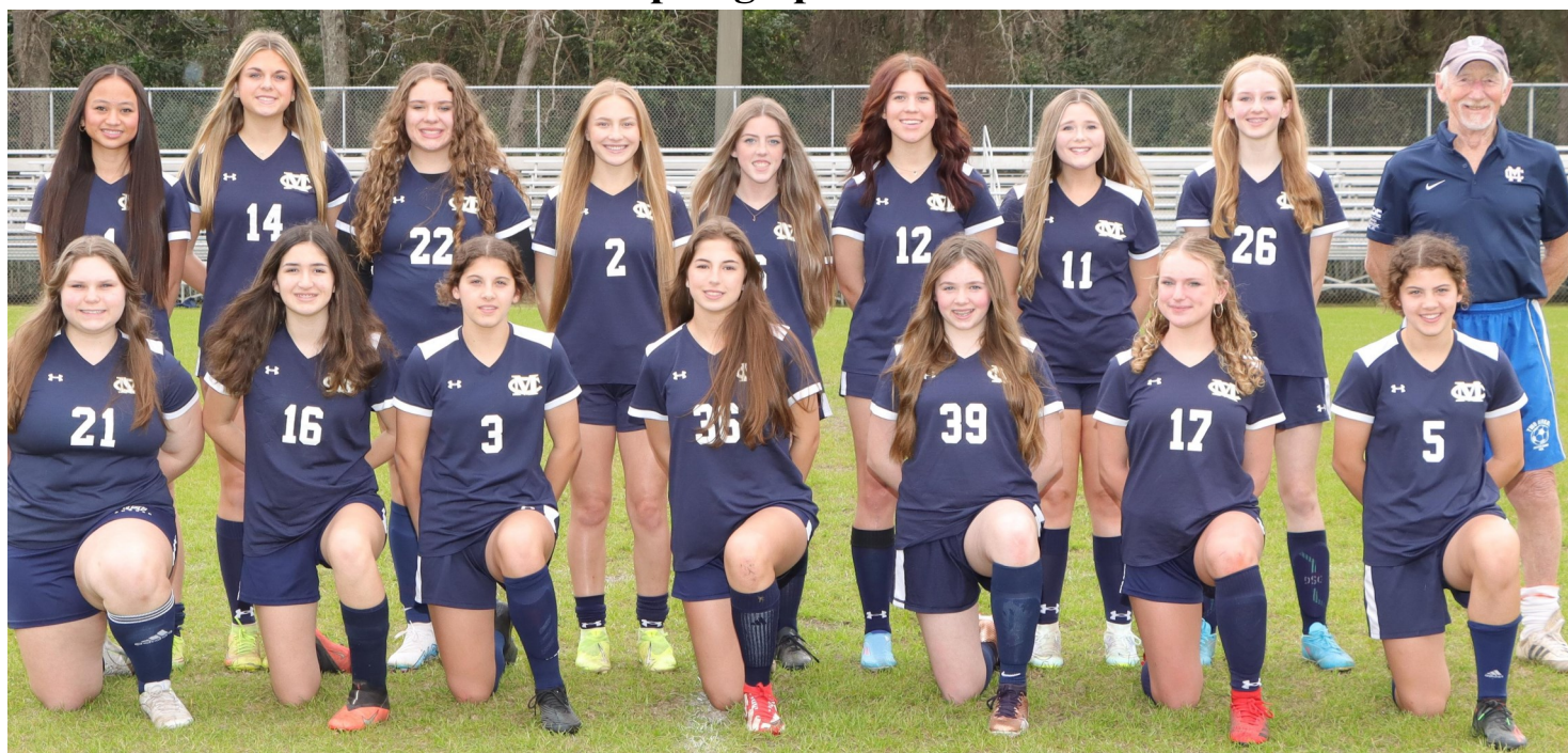
Varsity Girls Soccer