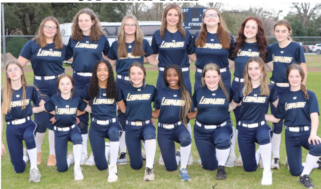
JV Softball Team