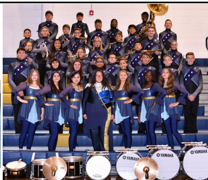
Marching Band and Color Guard