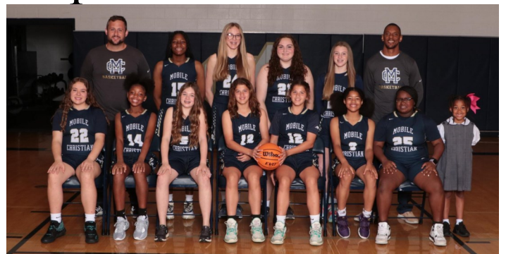
Middle School Girls Basketball Small School Tournament Champions