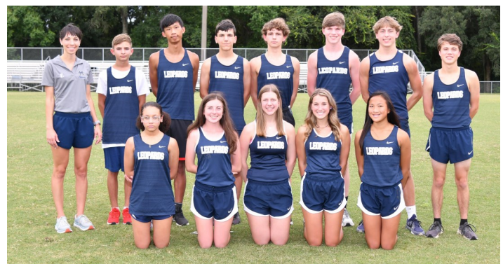
Varsity Cross Country