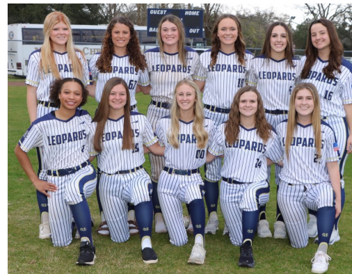
Varsity Softball Team