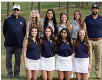
Girls Golf Team