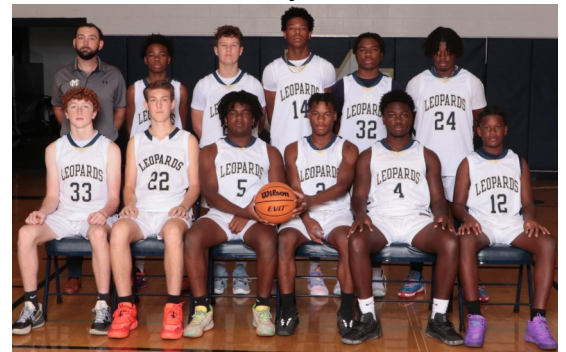
JV Boys Basketball