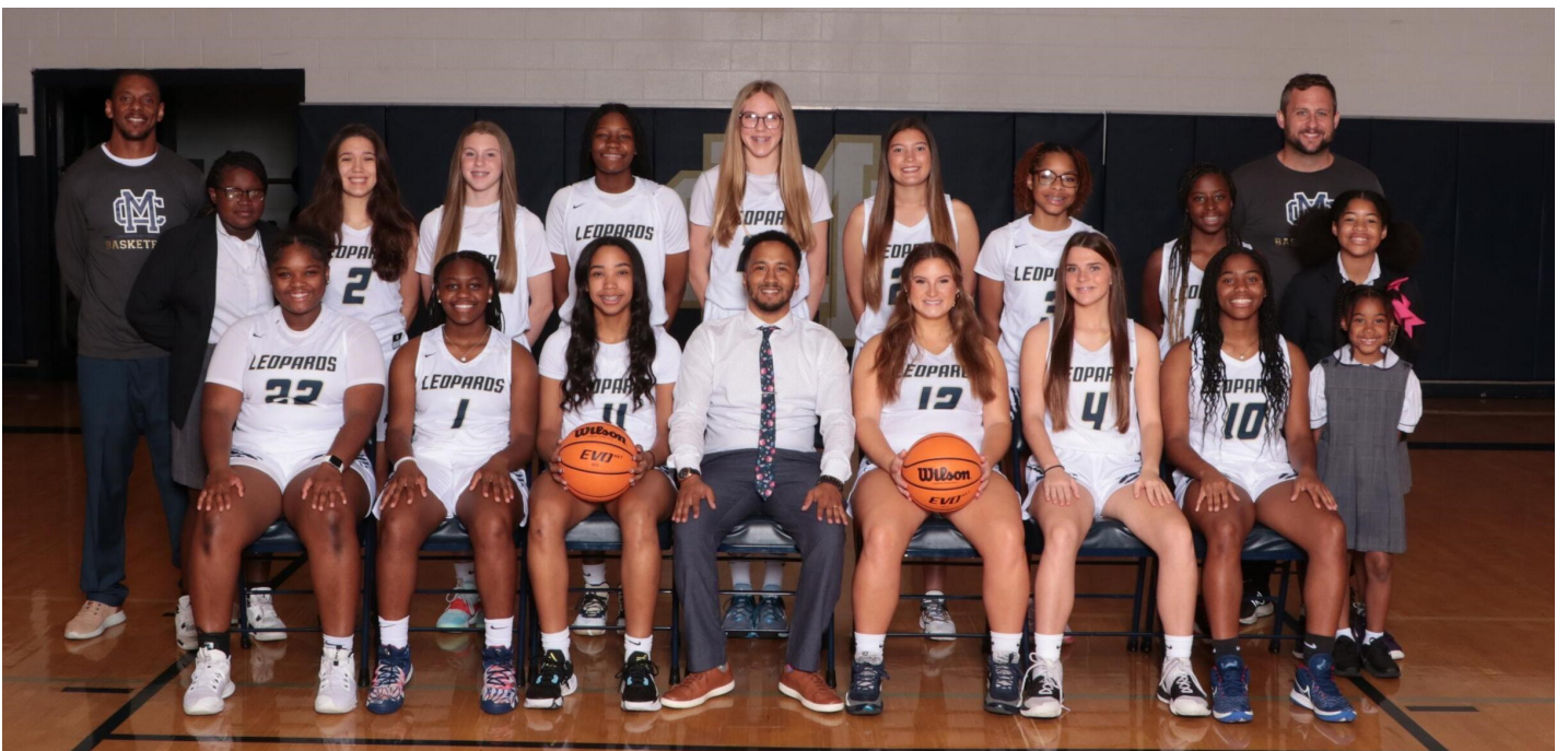
Varsity Girls Basketball Team