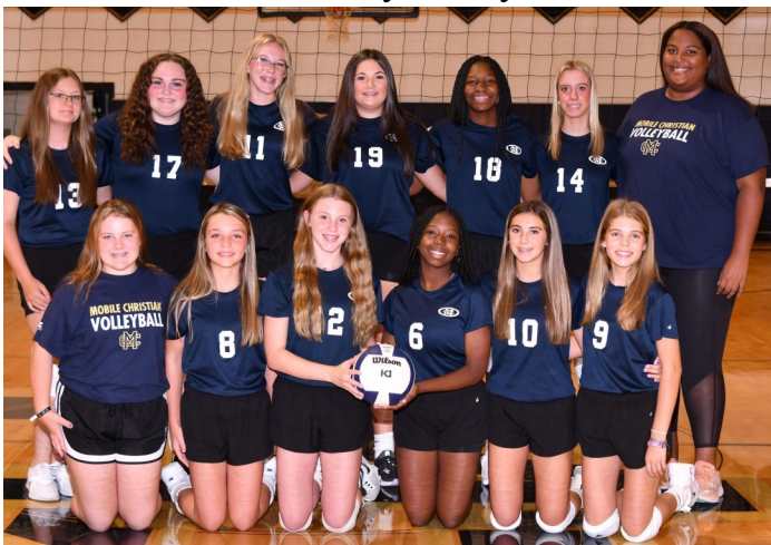
Middle School Volleyball