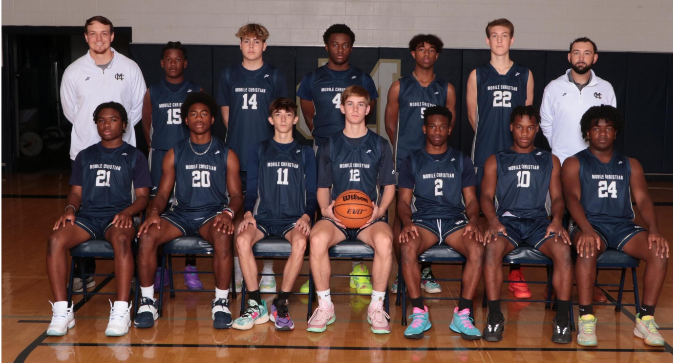
Varsity Boys Basketball Team