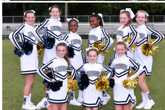
Middle School Cheerleaders