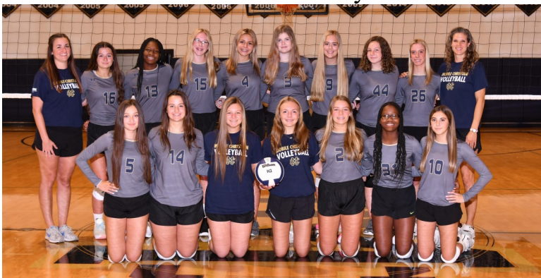
Junior Varsity Volleyball