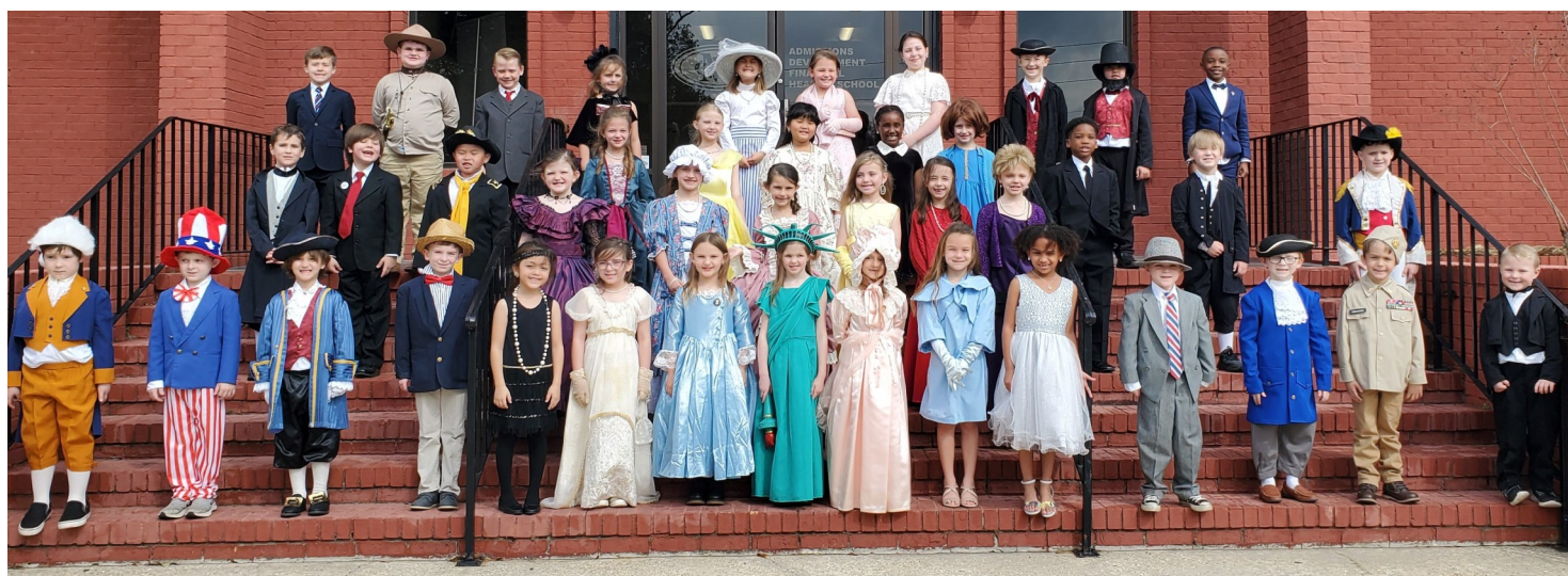
1st Grade Famous Americans Day