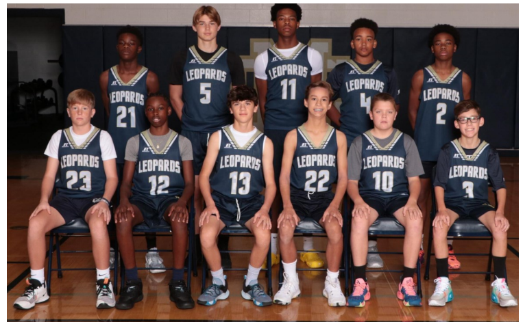
Middle School Boys Basketball