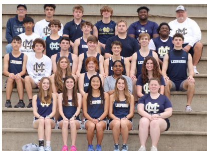
Indoor Track- Girls won State 3A