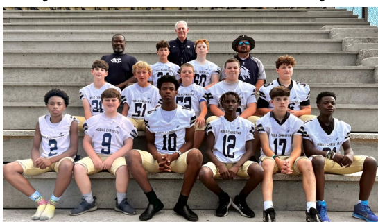
Middle School Football