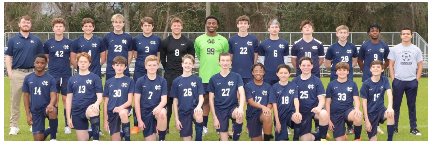
Varsity Boys Soccer Team