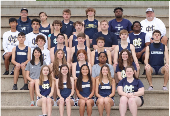
3A Track Team