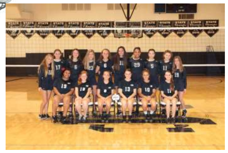
Junior Varsity Volleyball