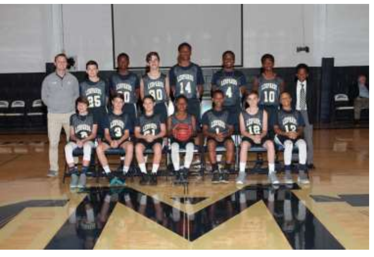
Middle School Basketball