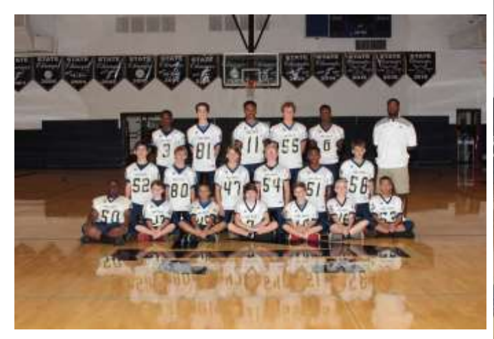
Middle School Football 3A Division Champions