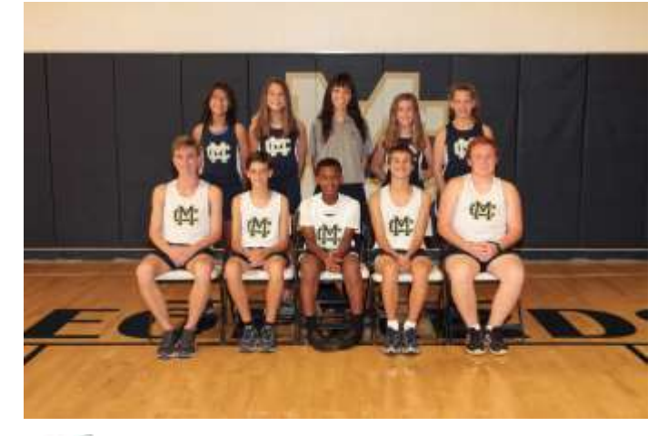
Varsity Cross County