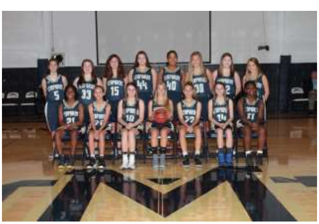
Middle School Girls Basketball