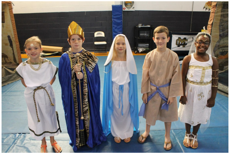
Once again MCS third graders participated in Bible Times Day and learned about the style of dress and culture of the period.